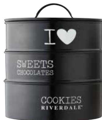
Gourmands candy boxes, $69.90, Metro (TCP)

[ Left page ] Love 3L cookie jar, $129.90; Etagere black tier muffin stand, $132; Wooden tray, $79.90; Bonbonnières set of 2 biscuit jars, $99.90 (smaller one shown here); Love mugs, $12.90; Table xmas tree, $29.90; Xmas twigs, $19.90; Metal bird stand, $19.90; Set of 6 limonade glasses, $49.90 (2 shown here); Vintage bottle, $15; Love pizza plate 32cm, $49.90; Love diner plate 29cm, $22.90; Love pasta plate 22cm, $22.90; Love bowl 15cm, $18.90; Homemade cake stand, $89.90; Spot On red placemat, $6.90; Buschetta board, $31.90; Fromage cheese board (shown here with cupcakes inside), $116 — All from Metro (TCP); Double Chocolate Chip and Chocolate Chip muffins, $3.10 each, Famous Amos (CWP, NP); Soft 'N' Chewy, No Nut Chocolate Chip cookie, $2.50, Famous Amos (CWP, NP); Vanilla Chocolate and Chocolate Chocolate cupcakes, $3.20 per cupcake, Twelve Cupcakes (CCP); White Chocolate Butterscotch roll, $9.90 per slice, Awfully Chocolate (CCP)