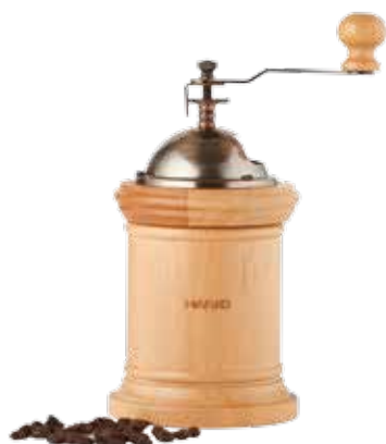
Hario coffee mill, $46, Metro (TCP)