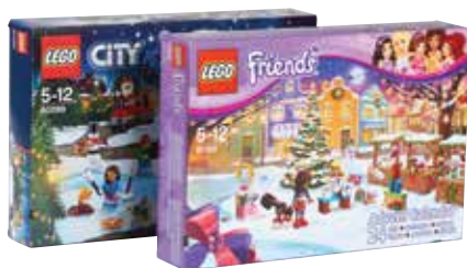
LEGO City Advent Calendar & LEGO Friends Advent Calendar, $34.90 each Bricks World (NP)