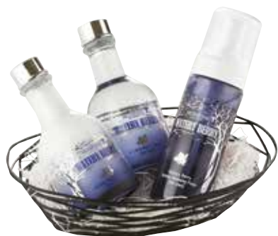
Water Berry Men's cleansing foam, toner and emulsion $26.90 – $41.90, Skin Food (NP)