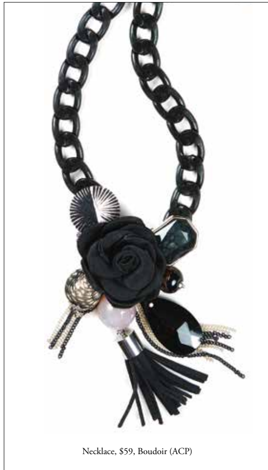
Necklace, $59, Boudoir (ACP)