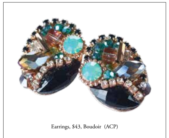
Earrings, $43, Boudoir (ACP)