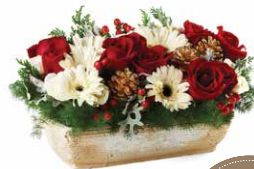
Heartening Holidays floral arrangement, $85.60 (inc. GST and delivery). Xpressflower.com (CWP, NP)