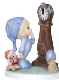
Precious Moments® Figurine — Counting The Seconds 'Til Christmas, $95 Precious Thots (CWP)