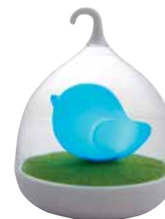
Bird night light, $25.90 Artbox (CWP)