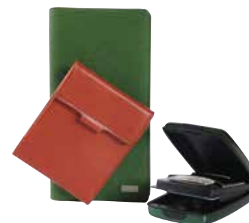
Green wallet: $109, Brown coin fold wallet: $139, Card holder: $69, The Wallet Shop (NP)