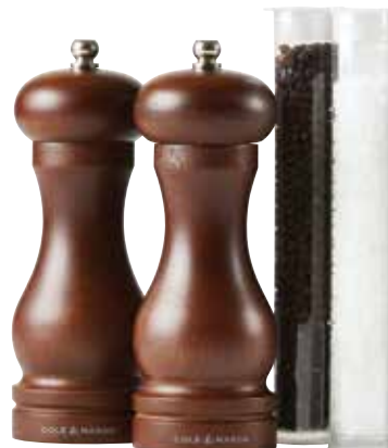
Cole & Mason wooden salt & pepper mill, $61.90, Metro (TCP)