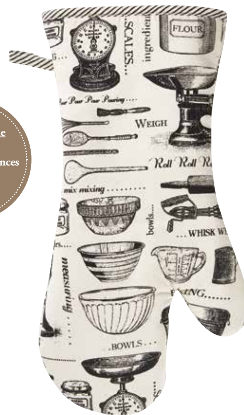
Diner Co double oven mitten, $30.90, Metro (TCP)

Yandle Candle 20% off all Christmas fragrances from 1 Nov to 31 Dec