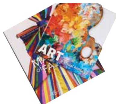
Art books, $49.22 (top), $71.58 (bottom) Times Bookshop (TCP)