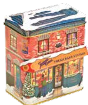
Small Canopy Tin — Snow House, $17.60 Famous Amos (CWP, NP)