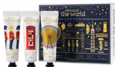
Around the World hand cream set $17.90 TheFaceShop (CWP, NP)