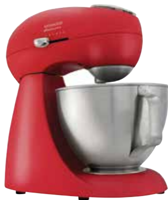
Kenwood Patissier MX311 mixer, $449, Harvey Norman (NP, BP)