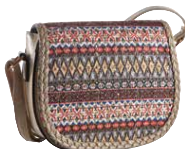
Sling bag, $35.90 I Love Accessories (NP, EPM)