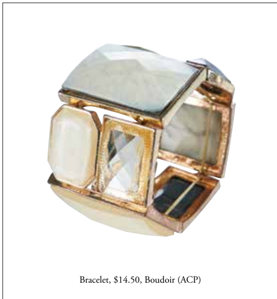
Bracelet, $14.50, Boudoir (ACP)