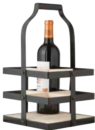
Bistro bottle holder, $79.90, Metro (TCP)

FROM FESTIVE TABLE TOPPERS TO QUIRKY OVEN MITTS, WE'VE GOT YOU COVERED WHEN IT COMES TO PUTTING TOGETHER THE PERFECT PARTY.