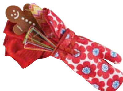
Assorted baking tools, $9.90 – $33 Metro (TCP)

Planning A Festive Do ...but don't have the fridge space? An ice-filled bathtub or cooler will do in a pinch!