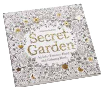
Secret Garden colouring book, $12.90 Du Yi Bookshop (BP)

Oh, What Sweetness In The Air One of the simplest ways to diffuse an aroma oil is to add a few drops to a small bowl of warm water and let the steam do the work.