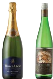
Henri Abele Brut Nv, $89; La Boheme Act 1 Riesling 2015, $54 Crystal Wines (VP)

The Classic Bellini Add two parts of bubbly to one part peach puree for this classic cocktail.