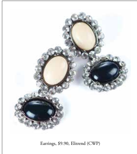
Earrings, $9.90, Elitrend (CWP)