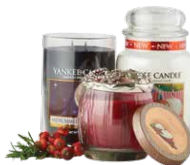
Midsummer's Night large tumbler, $41.90; White Chocolate Apple large jar, $41.90; Orchard Pure Radiance medium vase, $35.90 — All from Yankee Candle (CCP)

Yandle Candle 20% off all Christmas fragrances from 1 Nov to 31 Dec