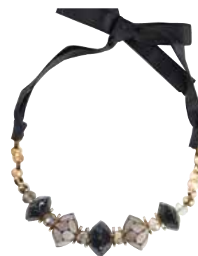
Necklace, $53 Boudoir (ACP)

Picture Perfect Replace name tags on your gifts with a snap of the recipient for a special touch!