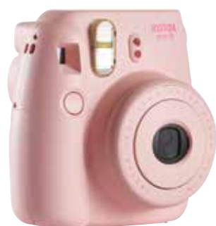
Fujifilm Instax mini 8, $159 Courts (CWP)

Away With Holiday Stress Organise shopping lists by category (books, toys, etc) so that you only have to make one trip to each store.