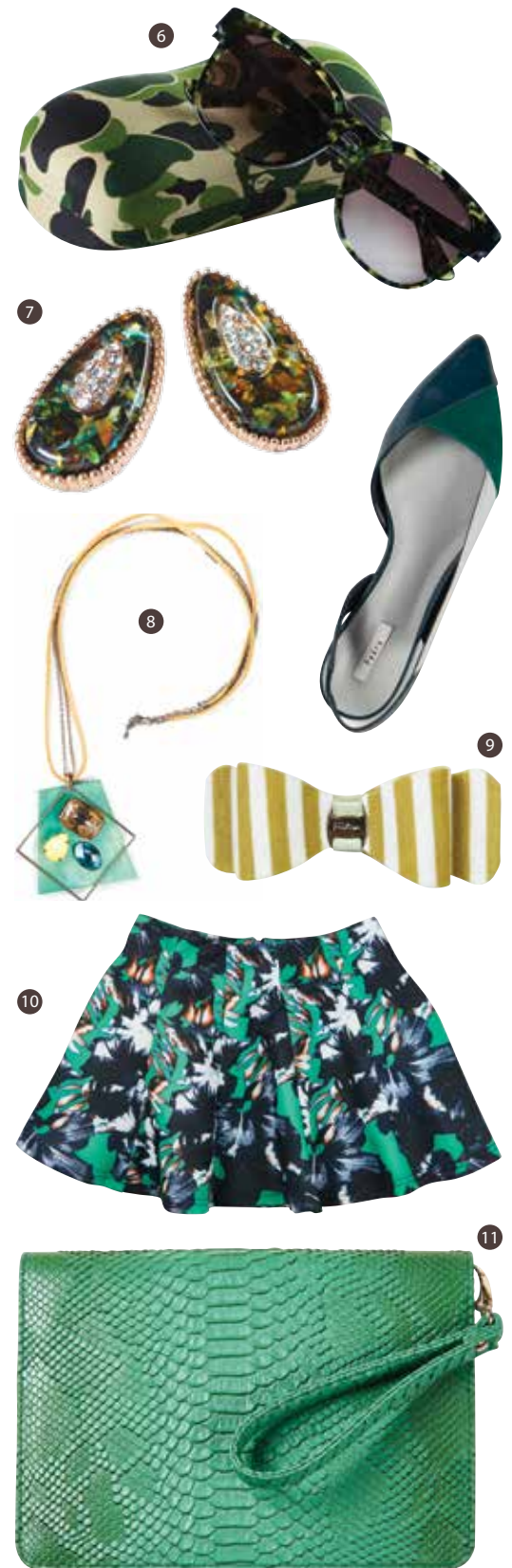
[ On Her ] 1. Beaded blouse, $56.90, La Trendz (ACP) 2. Culottes, $79, Sans & Sans (TCP) 3. Tassel earrings, $39, Devotz (CSC) 4. Drawstring handbag, $99.90, CHARLES & KEITH (CWP) 5. Wedged sandals, $34.40, Pedro (ACP) 6. A Bathing Ape sunglasses, $475, Nanyang Optical (CWP) 7. Earrings, $19.90, Devotz (CSC) 8. Necklace, $49, Boudoir (ACP) 9. Bow hair clip, $7.90, Helen (CWP) 10. Printed skirt, $28, Feminu (NP) 11. Snake skin slingbag, $29, Metro (TCP)