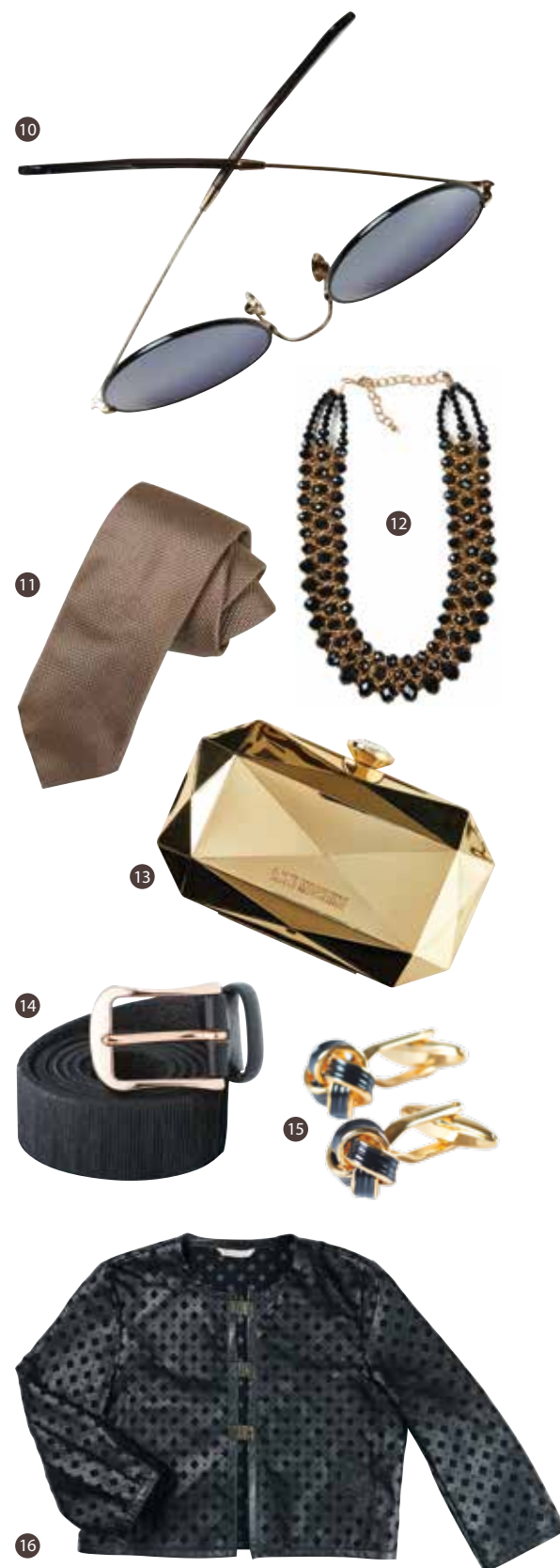
[ On Her ] 1. Petite gold shift dress, $79.90, Dorothy Perkins (CWP) 2. Acrylic necklace, $49, Boudoir (ACP) 3. Rings, $19 each, Sans & Sans (TCP) 4. Waist bag, $59.90, CHARLES & KEITH (CWP) 5. T-Bar wedge, $56.90, CHARLES & KEITH (CWP) [ On Him ] 6. Jo Burton shirt, $199, Metro (TCP) 7. Jo Burton cardigan, $289, Metro (TCP) 8. Necktie, $29.90, Man Studio (NP) 9. Pants, $99.90, Man Studio (NP) 10. Grafik sunglasses, $325, Nanyang Optical (CWP) 11. Necktie, $69, Metro (TCP) 12. Beaded necklace, $13.90, Chamelon (CWP) 13. Moschino metal clutch, $290, Metro (TCP) 14. Belt, $189, Metro (TCP) 15. Cuff links, $69, Goldlion (NP) 16. Perforated crop jacket, $299, Metro (TCP)