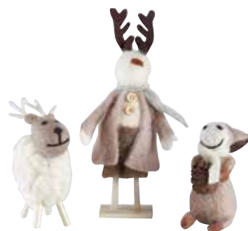
Figurines, $13 – $16 Lalu (TCP)

Away With Holiday Stress Organise shopping lists by category (books, toys, etc) so that you only have to make one trip to each store.