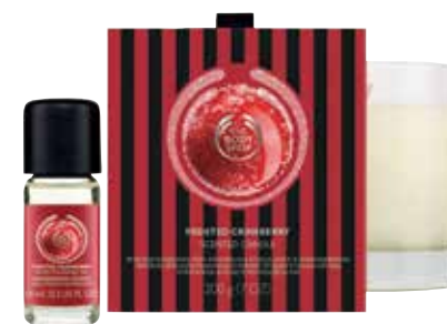
Frosted Cranberry home fragrance oil, $12.90 Frosted Cranberry candle, $36.90 The Body Shop (TCP)

Oh, What Sweetness In The Air One of the simplest ways to diffuse an aroma oil is to add a few drops to a small bowl of warm water and let the steam do the work.