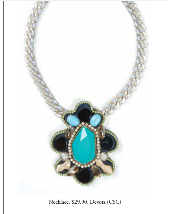
Necklace, $29.90, Devotz (CSC)