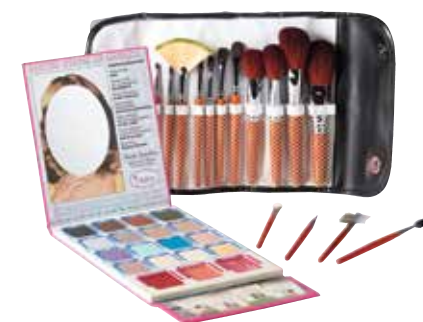
Brush set: $26.40 The Balm, Balm Voyage palette: $79.90 Sasa (CWP, NP)