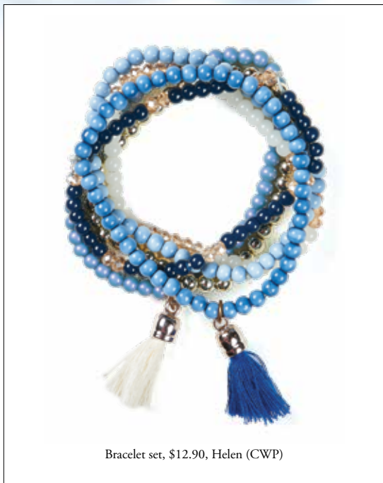
Bracelet set, $12.90, Helen (CWP)

NO BETTER TIME THAN NOW TO AMP UP YOUR LOOK WITH BOLD JEWELS AND VIBRANT COLOURS.