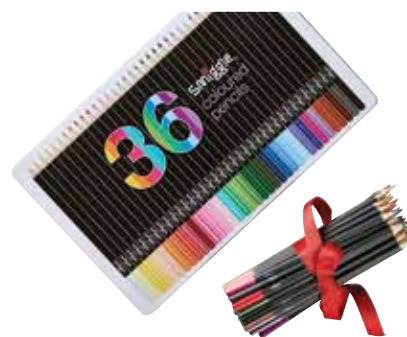
Smiggle set of 36 coloured pencils tin, $32.95 Smiggle (NP)