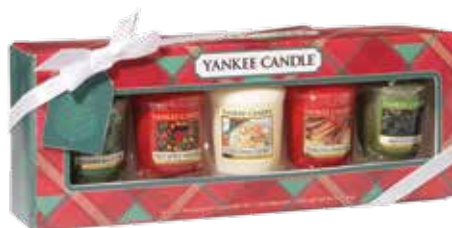
Holiday Samplers Votive candles box set, $16.90 (U.P. $24.90) Yankee Candle (CCP)

The Classic Bellini Add two parts of bubbly to one part peach puree for this classic cocktail.