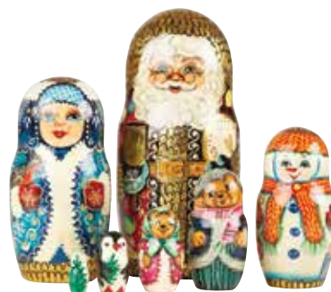
Matroyska Santa Claus 7 set, $469 The Better Toy Store