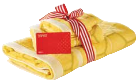
Esprit towel set, $24.95 Esprit (CCP, CWP)