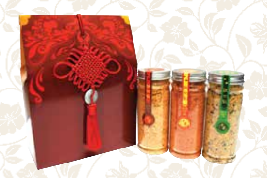
Enjoy a special CNY price on Shihlin Floss at $7.80 (U.P. $8.80) and the Shihlin Floss Gift Set at $22.80 (U.P. $28.80) for a limited time only! Available in Original, Spicy Cuttlefish, and Sesame Seaweed flavours.

Offer is only available at Northpoint and Waterway Point. To enjoy the special price, please present offer to staff when ordering. While stocks last.