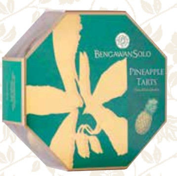
Premium pineapple tarts, $39.80 Bengawan Solo (ACP, CWP)

TO GIVE AWAY OR TO TAKE HOME, THESE TRADITIONAL CNY GOODIES AND DELICACIES ARE SURE TO DELIGHT.