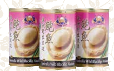
Australia wild blacklip abalone F1 120g (3 Cans), $82.80* Hock Hua Tonic (CWP, EPM) *Prices subject to change without prior notice.