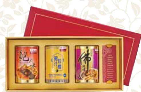
'Joyous Journey' gift set, $78.00 (U.P. $100.40) Eu Yan Sang (CWP, NP)